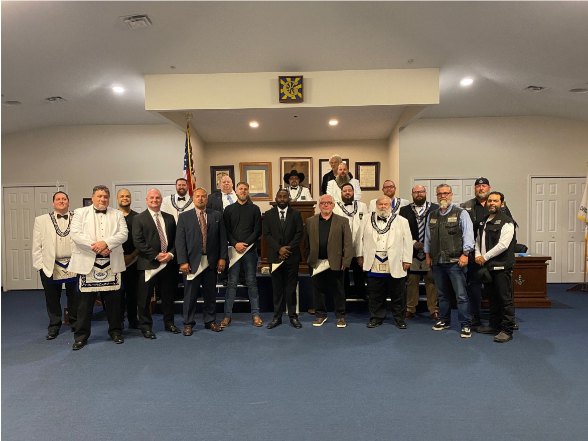
Fellowcraft & Entered Apprentice Degrees