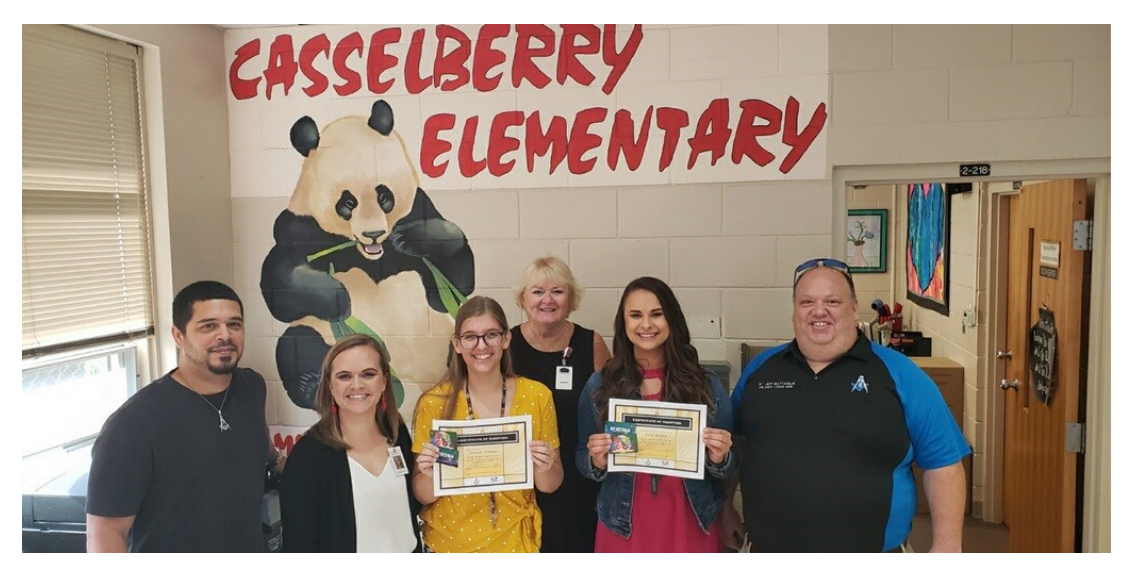
Casselberry Teachers say, "Thank You!"

Do you have pictures you'd like to share?