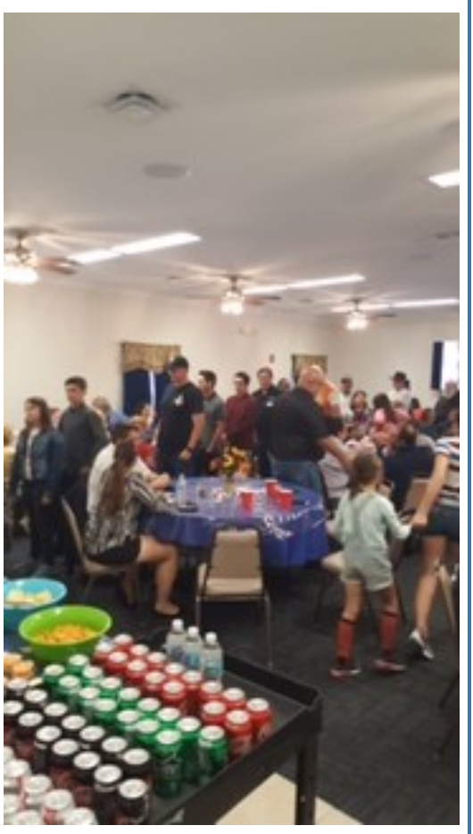
Family Fun Night Dinner