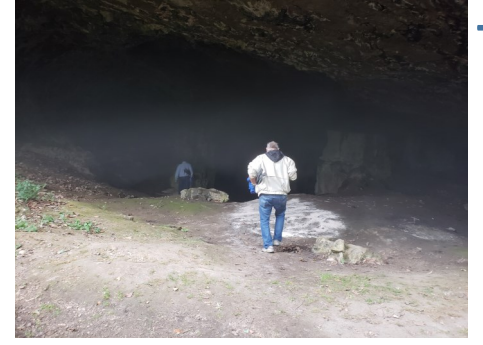
Descending Into the Deep