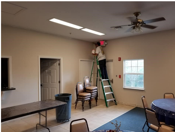
Fixing up the Lodge