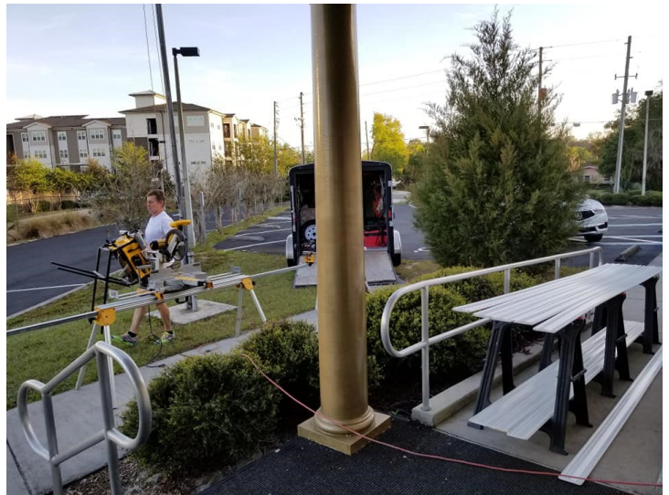
South Seminole Foyer Renovation