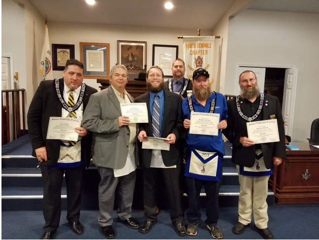
MLT Award Recipients