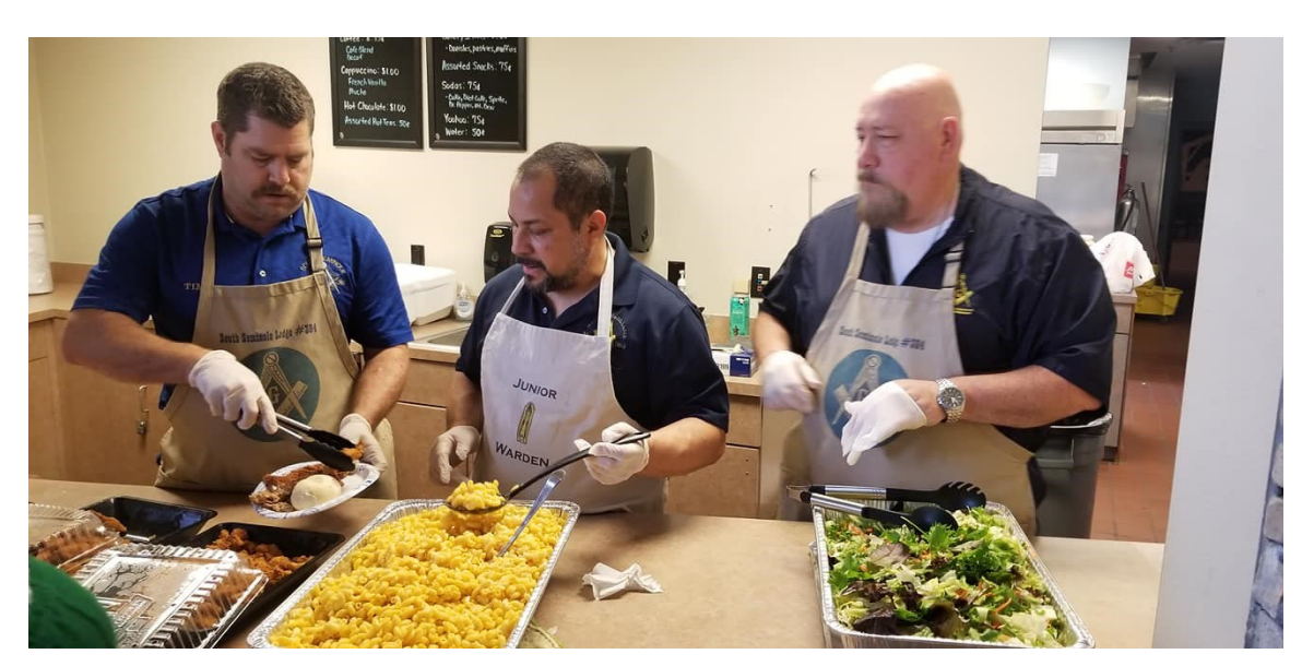
Do you have pictures you'd like to share?

Please send them to us and they will be posted in the next Trestle-board!!