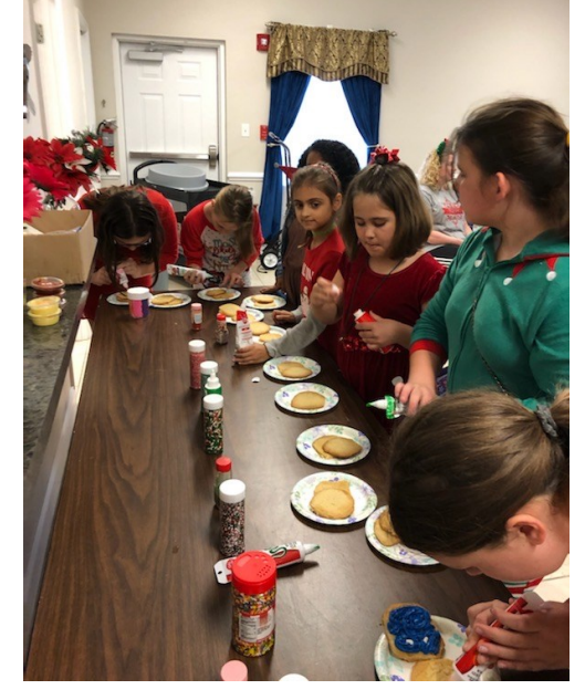
Rainbow Christmas Party