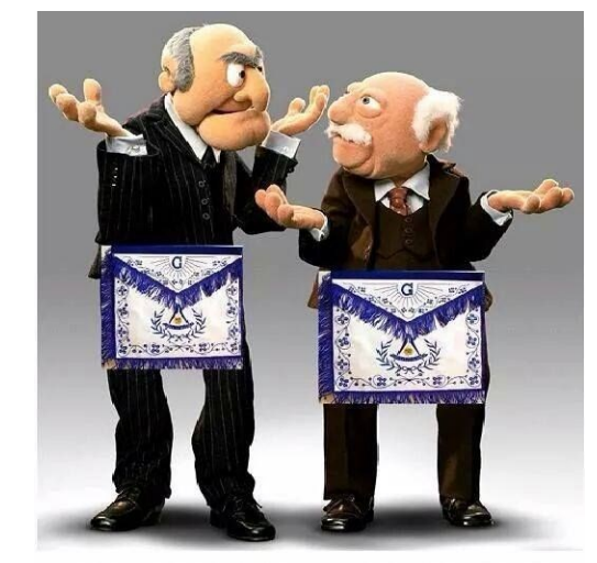
"You know, the new line of officers isn't half bad." "Nope, they're ALL bad!"