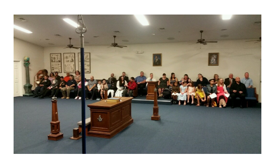
Family, Youth and Widows Night Dinner