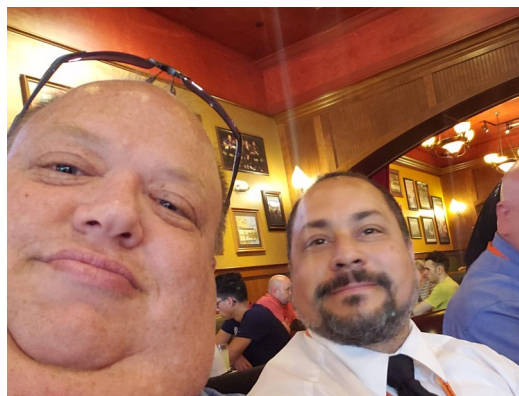
Grand Master Communication Lunch!

Do you have pictures you'd like to share?